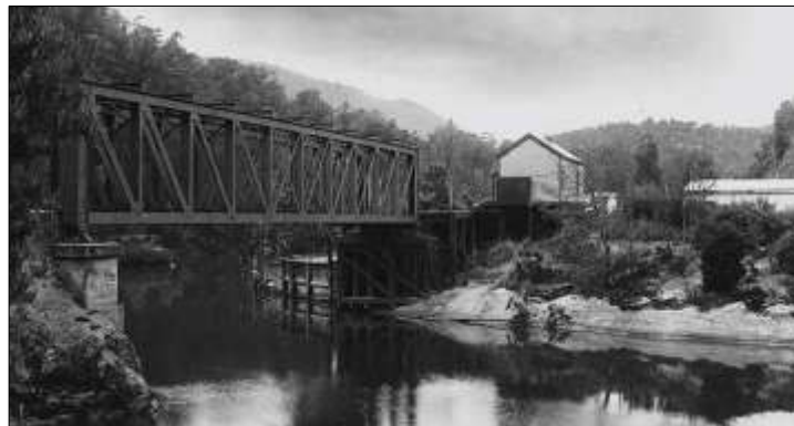
Figure 13 Iron Bridge from D/S with view of Teepookana yard